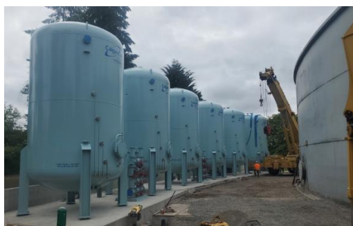
6/18/2024 construction progress of the new Hoffman Hill PFAS Filtration Facility.

Groundwater-sourced drinking water travels through the ground, dissolving naturally occurring minerals, and it can pick up substances resulting from the presence of animals or human activity. To ensure that tap water is safe to drink, EPA prescribes regulations that limit the amount of certain contaminants in water provided by public water systems. Contaminants that may be present include microbes, inorganic and organic chemicals, pesticides and herbicides, and radioactive materials.